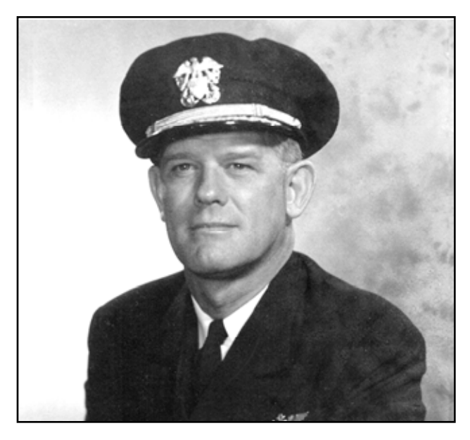
Donald Gay, Rear Admiral, USN (Ret.)